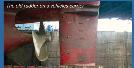
The old rudder on a vehicles carrier

Tel. +49-40-24199-1410 (office hours) Tel. +49-173-9229311 (24/7) service@becker-marine-systems.com