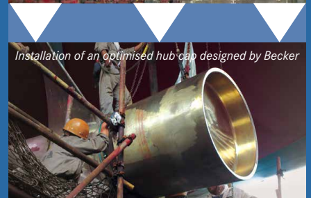
Installation of an optimised hub cap designed by Becker