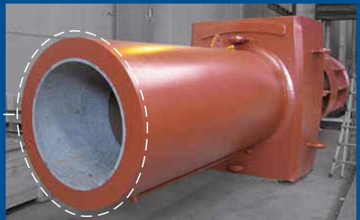
Trunk equipped with BBMS