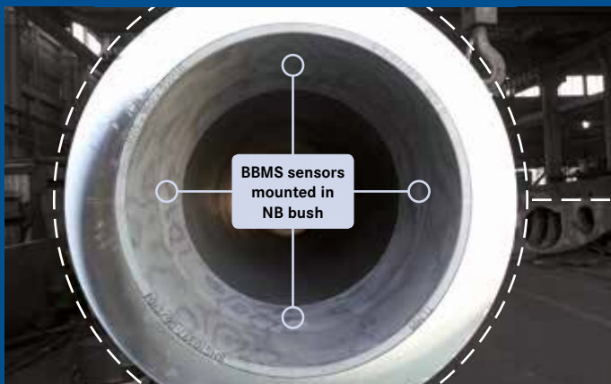
BBMS sensor positions in neck bearing bush